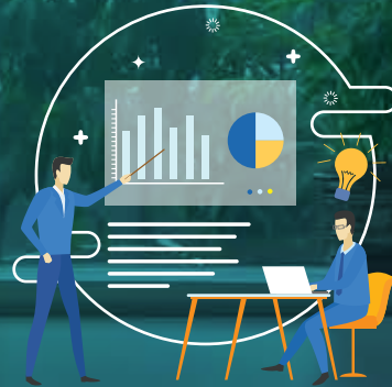
ANIMATION & SIMULATION