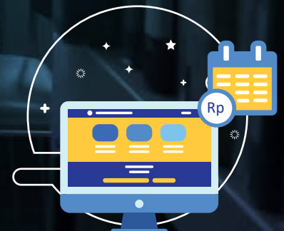
E-LEARNING PLATFORM RENTING