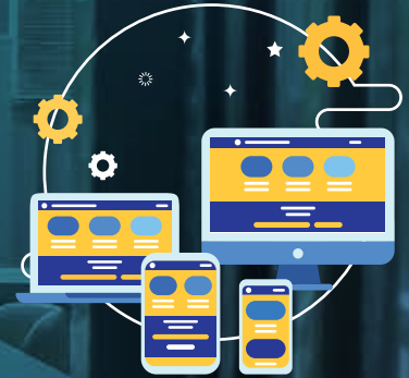
E-LEARNING PLATFORM DEVELOPMENT